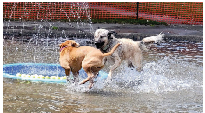
Dog Days of Summer FUN!!