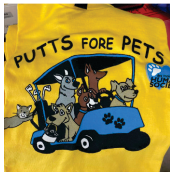
2nd Annual Golf Tournament